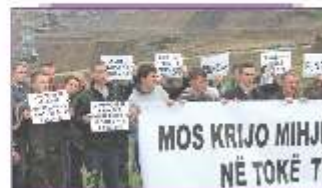
Photo: FIQ is a non-profit organization that works to strengthen the capacity of civil society organizations to promote and support the development of civil society in Kosovo.