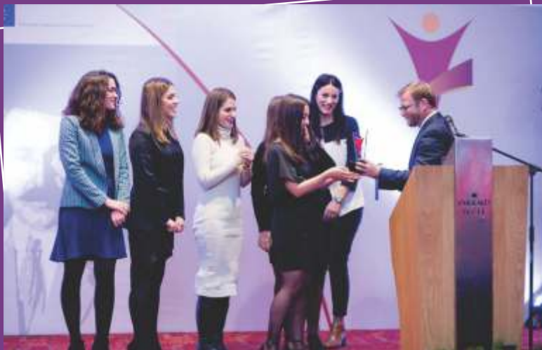
FIQ awarded the national prize for philanthropic contributions – “Hasan Prishtina” to Girls Coding Kosova