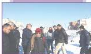
Photo: FIQ is a non-profit organization that works to strengthen the capacity of civil society organizations to promote and support the development of civil society in Kosovo.