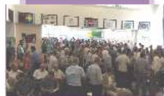
Photo: FIQ is a non-profit organization that works to strengthen the capacity of civil society organizations to promote and support the development of civil society in Kosovo.