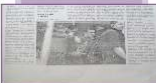
Photo: FIQ is a non-profit organization that works to strengthen the capacity of civil society organizations to promote and support the development of civil society in Kosovo.

The mission of the Forum for Civic Initiatives (FIQ) is to promote and support the development of civil society in Kosovo. FIQ is a non-profit organization that works to strengthen the capacity of civil society organizations to promote and support the development of civil society in Kosovo. FIQ is a non-profit organization that works to strengthen the capacity of civil society organizations to promote and support the development of civil society in Kosovo.