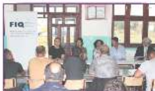
Photo: FIQ is a non-profit organization that works to strengthen the capacity of civil society organizations to promote and support the development of civil society in Kosovo.