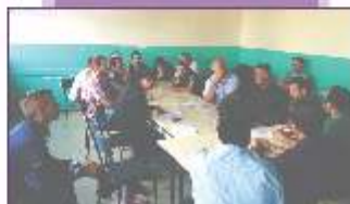
Photo: FIQ is a non-profit organization that works to strengthen the capacity of civil society organizations to promote and support the development of civil society in Kosovo.

FIQ is a non-profit organization that works to strengthen the capacity of civil society organizations to promote and support the development of civil society in Kosovo. FIQ is a non-profit organization that works to strengthen the capacity of civil society organizations to promote and support the development of civil society in Kosovo.